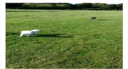
Maintaining and improving Community Parks