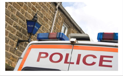
Working with Surrey Police to tackle crime in Spelthorne