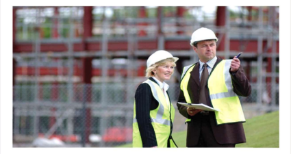
Building homes for the future