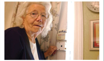
Focussing on a caring community