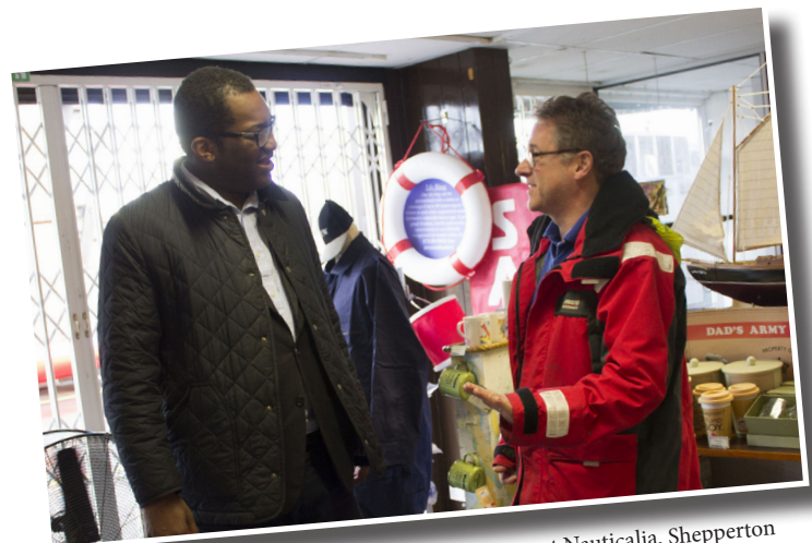
Assessing the flood damage at Nauticalia, Shepperton

Thames Water, the Council and the Environment Agency, and I am working hard to get to the bottom of things. It is important that steps are taken now to ensure that the events we witnessed do not happen again.