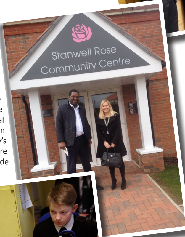
In Stanwell, March 2014

In early March 2014, I visited the Stanwell Rose Community Centre, which opened in September. The Centre has already proved to be a significant addition to the area and it is fantastic to see the impact it is having on the local community. Residents have been very positive and the Centre's many events and sessions are already reaching out to a wide variety of people in Stanwell.