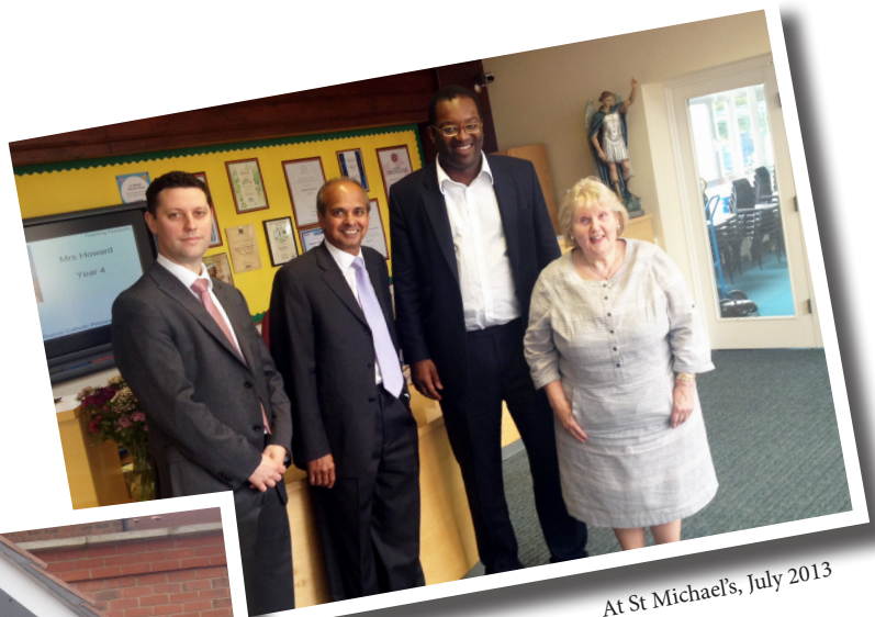
At St Michael's, July 2013

In late March 2013, I visited Mars FM, Matthew Arnold School's student run radio station. The DJs were very professional and enthusiastic. They asked me some good questions during a live interview and it was a pleasure to take part.