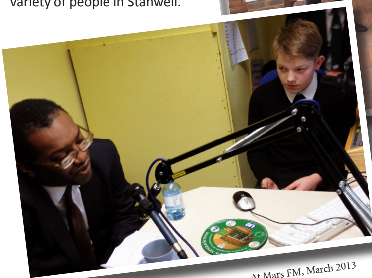
At Mars FM, March 2013