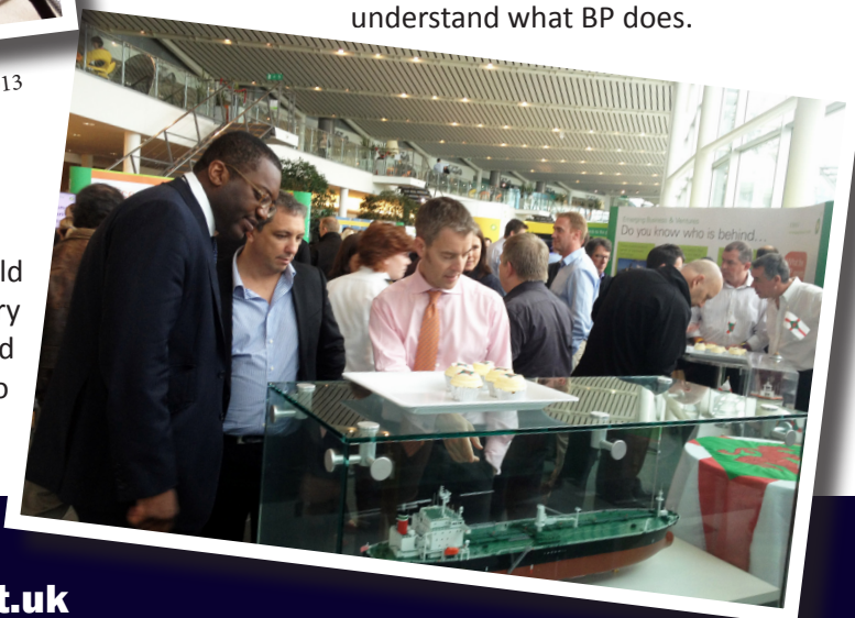
At BP, Sunbury, June 2013

BP first moved into the Borough in 1917. They are a major local employer. Over 5000 people now work at their Sunbury HQ in 55 different teams to support almost every part of BP's capabilities: scientific, technical, marketing and commercial. In June, I attended the company's Global Community Day, which brings staff together to showcase the breadth of their activities. The event was a very useful way to better understand what BP does.