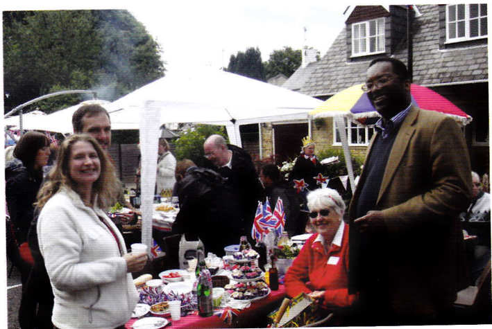
Diamond Jubilee party, Church Street, Staines

I have been campaigning for a solution to the problems associated with M3 motorway noise. I am pressing the Highways Agency for a commitment to resurface the Shepperton stretch of the M3 with a lower noise material as soon as possible. I also have a meeting with the Roads Minister scheduled this month.