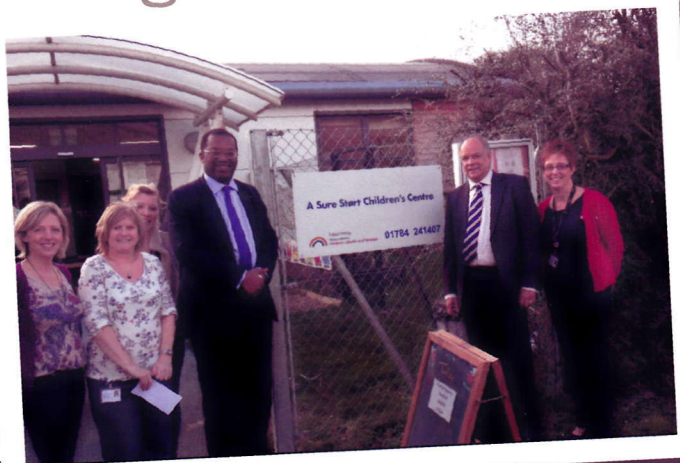
Visiting Stanwell Sure Start

Heathrow is strongly connected to the Borough. Around 4000 residents work at the airport and many more are employed in work related to it. While I support the airport whenever I can, I am very mindful that nothing should harm the quality of life here. Local Conservatives vetoed the idea of a new southern runway at our border. We also objected to Heathrow's proposal to build an energy-from-waste plant in Stanwell; they listened and abandoned the idea, agreeing to create a 'green ring' around the town. We achieved these outcomes through the good relationship we have built up with the airport over many years.