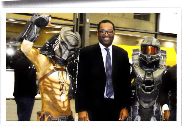
With the competition winners

With a second term in government, we can carry on creating jobs and giving families peace of mind about the future.