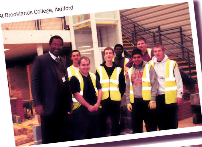
At Brooklands College, Ashford