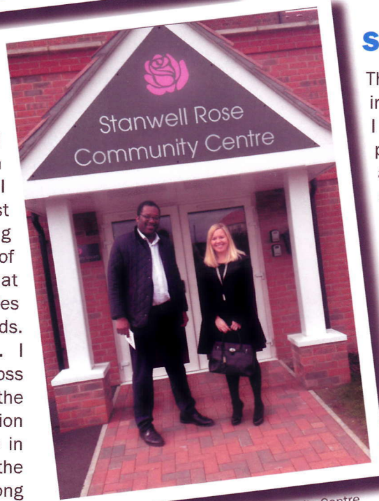
At the Stanwell Rose Community Centre

I urged Surrey County Council to resurface Clockhouse Lane and Charlton Road, and this has been done. Alongside local councillors, I petitioned Hounslow Borough against the implementation of a HGV parking ban along the A30 at the border of Spelthorne and Hounslow, a plan that would have led to displaced vehicles parking on our residential roads. They have agreed to scrap the plan. I continue to press for road repairs across the Borough and I am working with the Council to support the construction of a footbridge over the railway line in Clockhouse Lane. I also support the implementation of a HGV ban along Feltham Road.