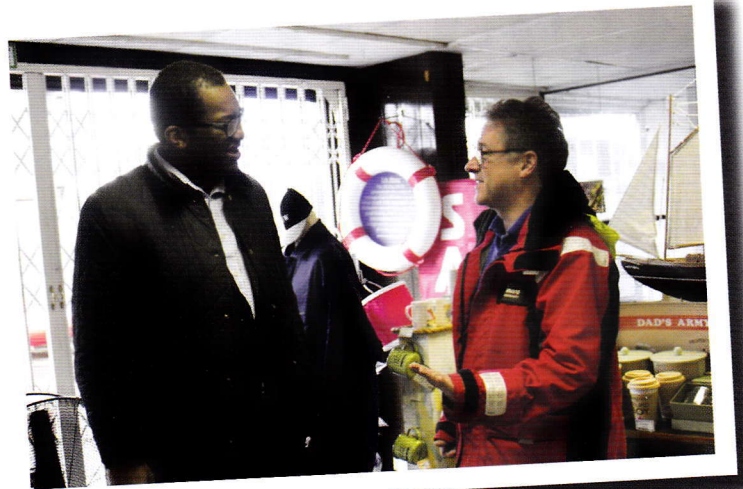
Assessing the flood damage at Nauticalia, Shepperton