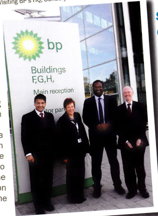
Visiting BP's HQ, Sunbury