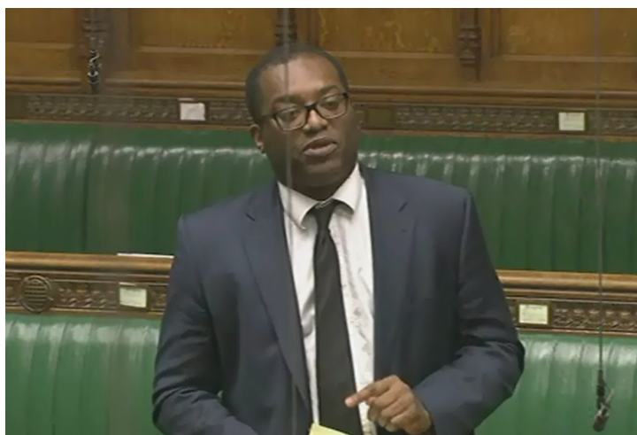
Speaking in a cost of living debate, November 2013

As Head of the Free Enterprise Group in Parliament, I have argued for tax cuts to incentivise hard work and enable businesses to grow. Recently, I proposed that business rates should be frozen for three years, and that ordinary workers should be taken out of the higher rate income tax bracket by raising the basic rate limit from £32,010 to £40,000.