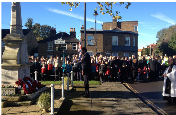
Remembrance Sunday in Stanwell, November 2013

This year, I went to the Remembrance parade and service in Stanwell Village. The sun was shining and it was a beautiful crisp morning. Hundreds of people turned out to gather around the war memorial. They included representatives from the armed forces, veterans, cadets, scouts, guides, cubs, brownies, beavers, rainbows and Town Farm Primary School. For me, the whole morning highlighted the strength and unity of our local communities.