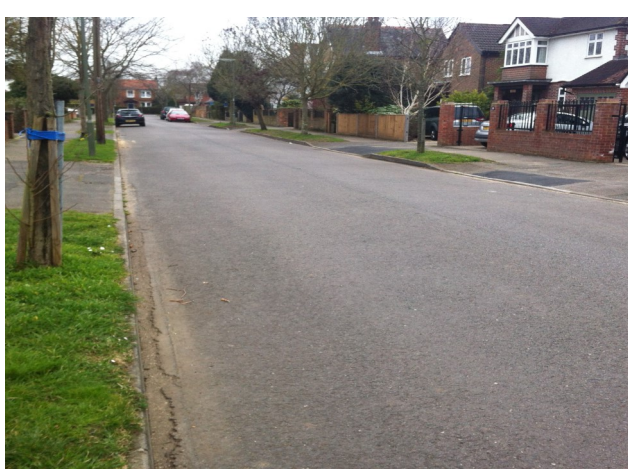
Ash Road Shepperton Green resurfaced